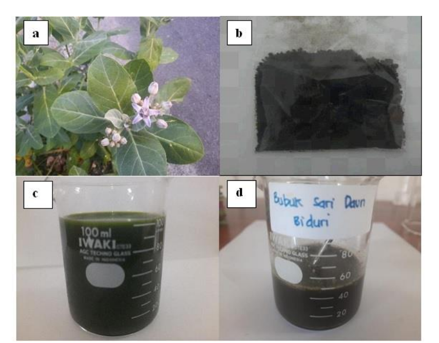
Figure 1. Biduri (Calotropis gigantean): (a) plant; (b) leaf pollen; (c) leaf extract; (d) leaf extract dilution 10<sup>-1</sup>.

The smell of suspesi soft cheeses was not significantly different. The suspesi soft cheeses coagulated with fresh and powdered biduri leaf extract were quite suspesi scented.